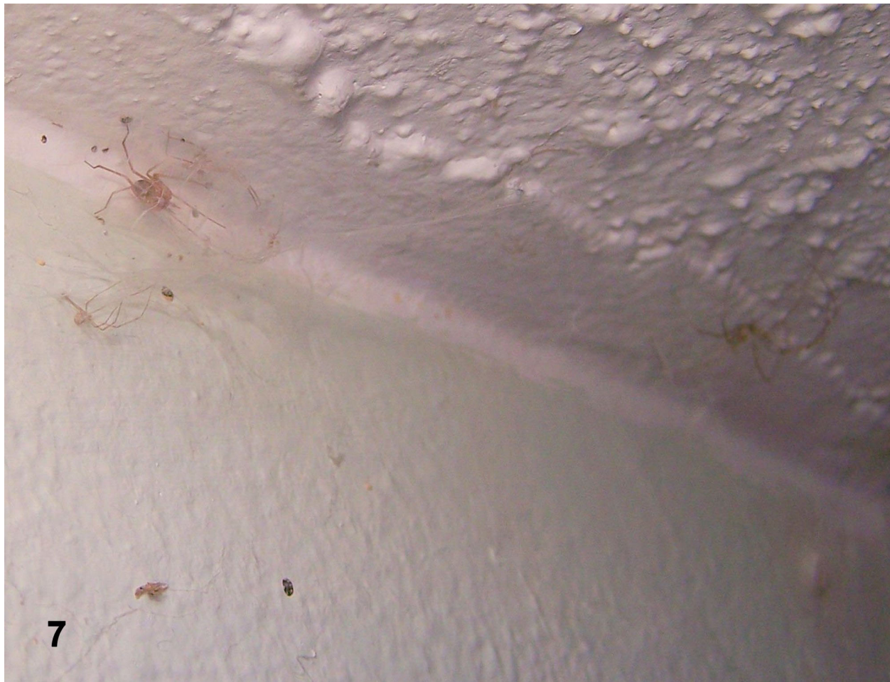
Figure 7. Adult male Cithaeron praedonius in nest in living room, recently molted, molt discarded outside nest. Note C. praedonius eggsac on wall at lower right. Also in background is another spider in a web, probably a Physocyclus globosus .

affecting the pet trade feeder cricket industry. Another possible source is the purchase by JTS of tarantulas at local “Repticon” events, a pet trade exposition, in the Tampa area. Potentially, tarantula specimens were imported and then sold at these events. If so, then it is possible that a gravid female or an eggsac of C. praedonius was on or in the shipping container.