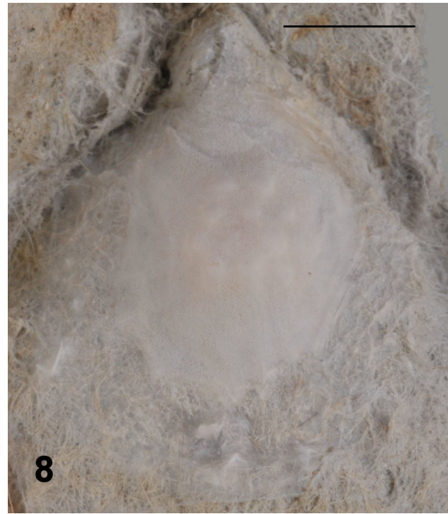
Figure 8. Eggsac of Cithaeron praedonius on egg carton. Scale line = 5 mm.

In appearance, C. praedonius eggsacs are white lenticular with a noticeable medial bulge, and tend to blend into the substrate. The base is a thicker pad of white silk about 4 mm in diameter on which the eggs are laid surrounded by a ring of fine silk about 2 mm in diameter which presumably helps anchor the central part. This section strongly adheres to the substrate and is very thin, the combination of which prevents it from being peeled from the substrate without destroying it. The covering is thin papery, almost cellophane-like, although not obviously translucent as in some related spiders. It is white and appears slightly tinted medially, due to the yellow eggs, and thin enough that some color from the substrate is visible through it in the peripheral part, which has a camouflaging effect. The central bulging section over the eggs is slightly oblong to circular, although the dimensions may depend on whether the substrate surface is flat or curved. Five eggsacs had the following dimensions: 10x10, 10x9, 10x8, 10x7, and 8x6 mm. Silk over the central area was extended outward to form a flat border surrounding the central raised area, 2-4 mm in diameter, which adhered it to the substrate. Probably due to the papery